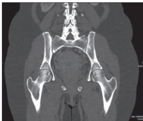
Figure 2 - Computed tomography scans displaying erosions on the iliac side of the left sacroiliac joint combined with a slightly poor definition of the iliac subchondral cortex.