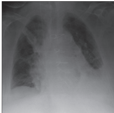
Figure 2 - Bilateral basal dysventilation (more evident in the left lung), and signs of bilateral interstitial edema.

the external rotation of the right leg was observed. This finding was consistent with the imaging results. In the first postoperative days, the chest x-rays showed the onset of a bilateral dysventilation (Figure 2). She was prompted to perform respiratory exercises with the goal of maintaining adequate oxygenation and pulmonary function. In the supine position, deep breathing, chest expansion, assisted cough, and chest manual vibration therapy were carried out. Meanwhile she was invited to perform the first in-bed assisted movements. Following a consultation with the orthopedic team, at an early stage, we encouraged her to sit at the edge of the bed to facilitate both feeding and respiratory exercises (incentive spirometer and deep breathings), which were performed at least twice daily during her hospital stay. The patient was lifted off the bed from the right side in order to avoid further fracture site complications. In this way, it was possible to maintain the hip in its natural position. While being moved, the limb was supported until the sitting position was reached. When the patient was confident with these postural changes, which were always assisted, the treatment progressed until she could attain an upright position while keeping the body load on the left limb. The patient was able to sit in a wheelchair that allowed her to use the bathroom. Although walking was not encouraged because of her high BMI,