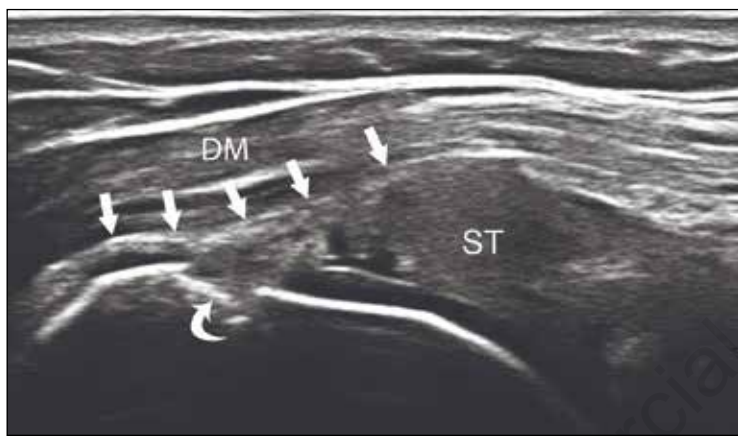
Figure 2 - Full-thickness lesion of the supraspinatus tendon. Longitudinal scan on the supraspinatus tendon showing bursal surface depression of the insertional tract of the tendon with loss of all fibers (arrows) (The tears should be measured along two axes). Some irregularities of the humeral head are also present (curved arrows). DM, deltoid muscle; ST, supraspinatus tendon.

- Inflammation: the experts agreed that the creation of a descriptive score would be very useful in order to improve the description of the inflammatory changes (such as