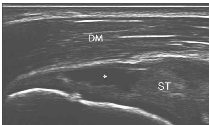
Figure 1 - Partial thickness tear of the supraspinatus tendon: longitudinal view showing an anechoic area of the bursal surface of the tendon (asterisk) in its pre-insertional tract due to the interruption of the tendon fibers for a partial thickness tear (The tears should be measured along two axes). DM, deltoid muscle; ST, supraspinatus tendon.

- Humeral head: the experts believed that