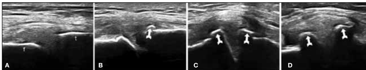
Figure 1 - Sequence of ultrasonographic images of the medial compartment of the femorotibial joint used to classify the severity of osteoarthritis (f: femur, t: tibia). a) Normal joint (grade 0); b) initial irregularity of medial femoral condyle and tibial bone profile due to minor osteophytosis, more evident on the tibia (arrow) (grade 1); c) moderate osteophytosis of the tibial and femoral surfaces with widening of joint profiles, reduction of joint space and mild extraflexion of the meniscus (grade 2); d) gross alteration of joint bone profile due to large osteophytes (arrows) and severe reduction of joint space with concomitant structural irregularity and almost complete protrusion of meniscus.

The data was processed using logistic regression analysis and SPSS version 12 software.