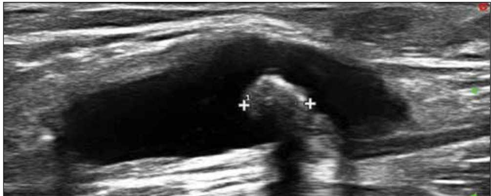
Figure 2 - Ultrasound image of Baker's cyst. The cyst is oval and located deep in the gastrocnemius and semimembranosus muscles. Distension of the bursa with fluid results in anechoic appearance and thickening of the posterior wall. A calcification inside the cyst (indicated by caliper) appears as a gross hyperechogenic mass with posterior shadow cone.