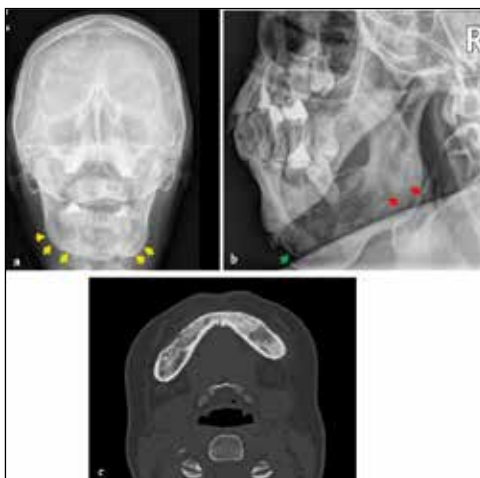
Figure 2 - A) and B) X-rays images and C) computed tomographic slice of the chin. These images show a widened mandible with irregular and thickened borders (yellow arrows) and with mixed lytic and sclerotic modifications of the bone texture (green and red arrows, respectively).

timal clinical response to the drug, no further invasive procedures were considered necessary. The patient is now doing well and is still in follow-up. One year later, the ALP and CTX values were both within the normal range (respectively 53 U/L and 0.37 ng/mL).