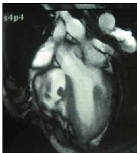
Figure 2 - Cardiac magnetic resonance image (four chamber view) showing two right intracardiac thrombi.