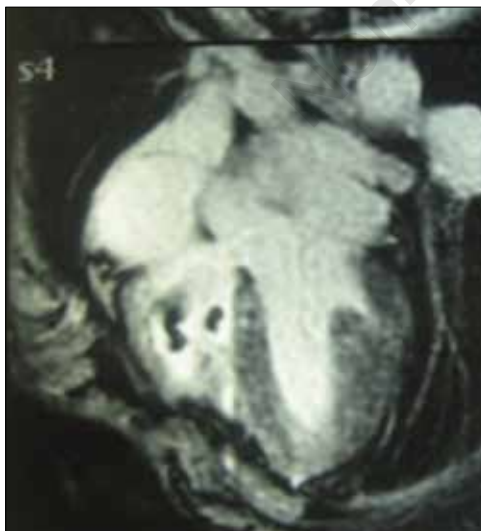
Figure 3 - Echocardiography revealed right intraventricular thrombus confirmed on cardiac magnetic resonance imaging.

A 25-year old patient with BD was admitted to the hospital with complaints of progressive dyspnea and fatigue for a couple of months. Echocardiography revealed right intraventricular thrombosis and CT thorax concluded with PE. A thrombectomy and oral anticoagulation were administered. One year later, he appeared with aphasia. Cranial CT concluded there had been an ischemic stroke, and echocardiography revealed a recurrence of right intraventricular thrombus. Thoracic CT showed multiple thrombosed PAA, and inferior vena cava thrombosis. Cyclophosphamide pulses and