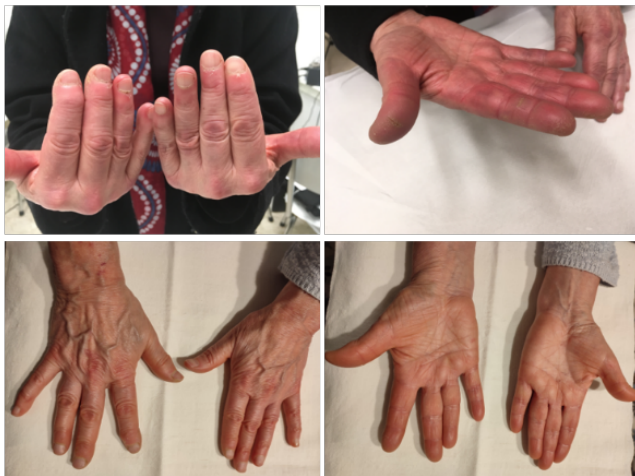
Figure 2. Patient 5: antisynthetase syndrome/AR, typical mechanic's hands before (upper part of the figure) and after treatment with tofacitinib (lower part of the figure).