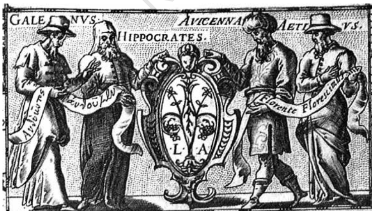
Figure 2 - Title page (detail), Hippocratis Cui Opera quae extant Graece et Latine veterum codicum collatione restituta, nouo ordine in quattuor classes digesta interpretationis Latinae emendatione, et scholijs illustrata , a Hieron. Mercuriali Foroliuensis, Venezia, Lucantonio Giunta, 1588.