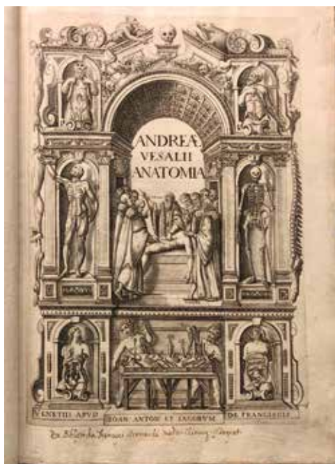
Figura 5 Title page, Andree Vesalii Anatomia , Venezia, Giacomo De Franceschi e Johannes Antonius, 1604.

the Venice Hospital from the XVIII to the XX Century. To summarize, the Scuola protects the inherited treasure of more than six centuries of health history.