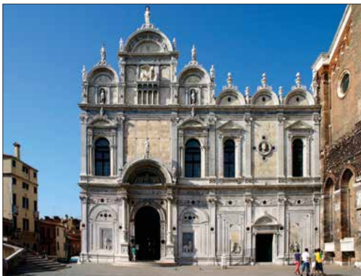
Figure 1 - Outside of the Civic Hospital SS. Giovanni e Paolo of Venice, formerly Scuola Grande di San Marco .

ery of the century: book printing with mobile characters of which Venice soon became a world leader (9, 10).