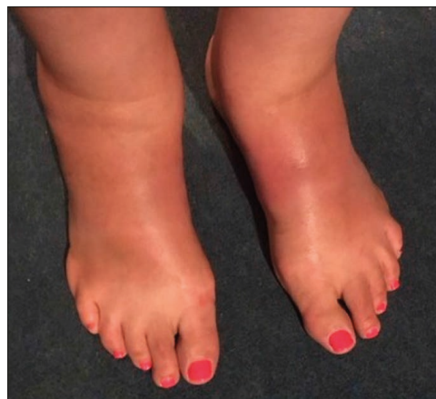
Figure 1 - Diffuse erythematous plaque of both feet.

pain which appeared later. She had previously received an ineffective course of oral antibiotics (amoxicillin 1 g t.i.d for 10 days) and denied any recent drug intake, travel, insect bite or allergy. Physical examination showed a high temperature of 39°C, warm erythematous plaque of both feet associated with painful edema (Figure 1), swollen ankles and bilateral positive squeeze test. Other examinations showed normal cardiopulmonary auscultation.