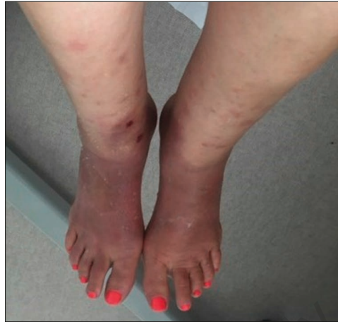
Figure 3 - Sclerodermiform-like evolution of both feet 4 weeks after diagnosis.

tation, and neither lymph nodes enlargement nor hepatomegaly or splenomegaly. Routine biological investigation showed an inflammatory syndrome with elevated C reactive protein (200 mg/dL), normal cell blood count, normal electrolytes, creatinine and liver enzymes. Hepatitis B, C, and HIV serologies were negative. 24-h-proteinuria and urine test strips were normal. Anti-neutrophil cytoplasmic antibodies (ANCA), antinuclear antibodies (ANA), rheumatoid factors (RF), and anti-cyclic citrullinated peptides antibodies (ACPA) were negative. Thoracoabdominopelvic scanner was normal and feet MRI demonstrated swelling limited to the subcutaneous tissue. Skin biopsy showed edema in the dermis and infiltration of the dermis by eosinophils. No signs of vasculitis were shown. Tissue direct immunofluorescence was negative for IgG, IgA, IgM, IgE, and complement (Figure 2). Bacterial cellulitis was ruled out because of negative blood culture and an inefficient antibiotics course. Anamnesis did not find any past history of allergy or recent drug intake, there were no eosinophilia on CBC and Ig E level was normal. Thus, allergic contact dermatitis and/or drug reaction with eosinophilia and systemic symptom (DRESS) were excluded. Moreover, clinical and immunological investigations