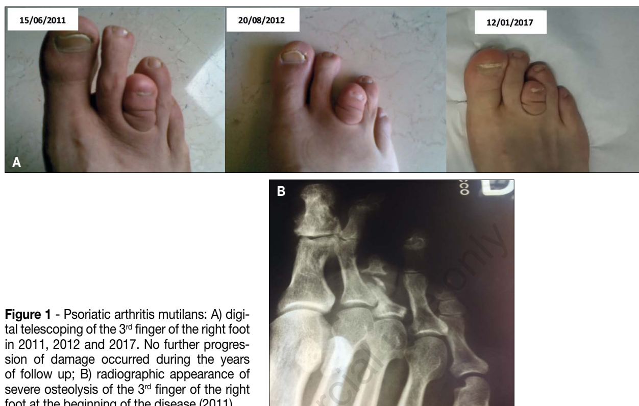
Figure 1 - Psoriatic arthritis mutilans: A) digital telescoping of the 3 rd finger of the right foot in 2011, 2012 and 2017. No further progression of damage occurred during the years of follow up; B) radiographic appearance of severe osteolysis of the 3 rd finger of the right foot at the beginning of the disease (2011).

3 rd finger of the right foot. At clinical examination, tenderness and swelling of both knees was found. Furthermore, tenderness and swelling of the 2 nd and 3 rd metatarsal and interphalangeal joints of the right foot was seen, with a telescopic deformity of the third finger (Figure 1A). Pain was very severe - enough to prevent the patient from walking. No signs of enthesitis or dactylitis was objectivated. The patient did not report any history of back pain. Serum samples revealed the presence of raised C reactive protein - CRP (12 mg/L) while erythrocyte sedimentation rate (ESR) was 30 mm/h. Rheumatoid factor (nephelometry) was negative and anti-citrullinated proteins antibodies were absent. Radiographic assessment of the right foot demonstrated the presence of a severe osteolysis with near-disappearance of the middle phalanx of third finger (Figure 1B). Skin involvement was very limited (only a small lesion of the scalp and the 2 nd and 3 rd fingers of the right hand with nail pitting) with a psoriasis area severity index (PASI) of 0.4.