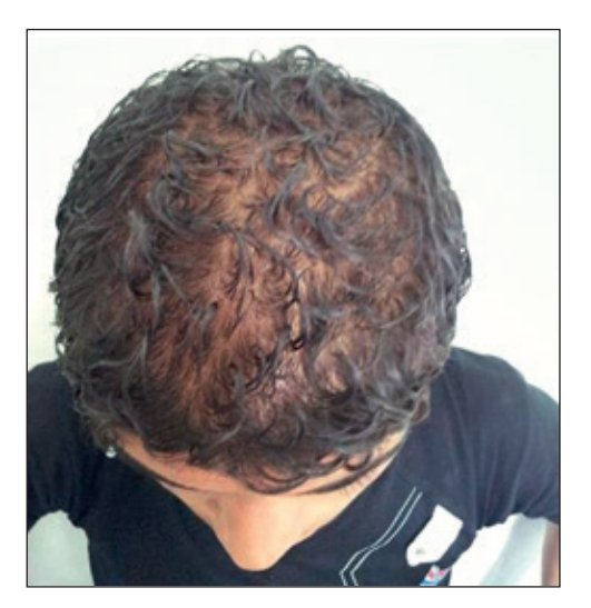
Figure 2 - Cutis verticis gyrata.

ened and non-pinchable. He had greasy and coarse skin with deep furrowed forehead skin, a seborrheic dermatitis and multiple folliculitis in the face. The scalp skin was folded with the appearance of a peculiar cutis verticis gyrate (Fig. 2). The patient showed pandigital clubbing and bulbous deformity of all digits of hand and feet (Fig. 3). In addition, he had hyperhydrosis of both palms and soles. Cutaneous examination over the rest of his body including mucosae was normal. There was joint effusion with a moderate restriction of motion in both knees. Joint fluid obtained by aspiration showed mechanical properties. The examination of cardiovascular system, respiratory system and abdomen revealed no significant abnormalities.