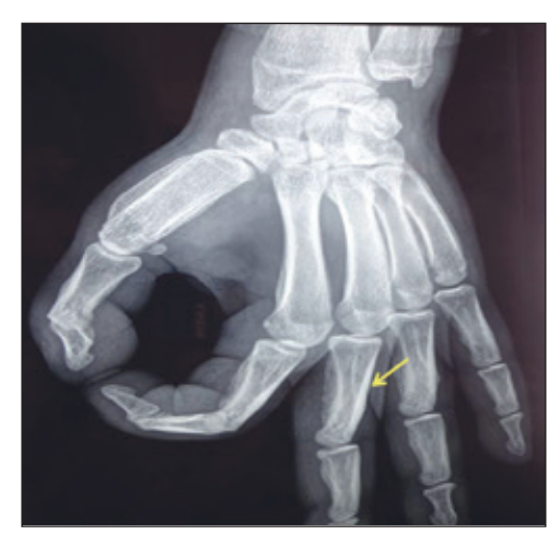
Figure 4 - X-ray of the right hand showing cortical thickening and periostosis.