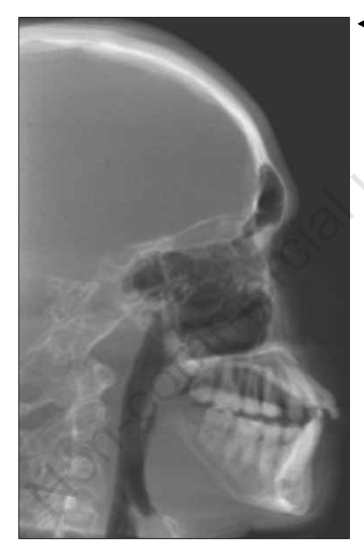
Figure 4 - Cone beam computed tomography image showing correction of the retrognathia at the end of orthodontic treatment.

border. The results showed that the mandible had moved forward and downward in relation to the anterior cranial base. In addition, bone apposition was observed on almost all of the surfaces of both mandibular condyles and the roof of the glenoid fossa. TMJ involvement is often asymptomatic in patients with JIA, and can lead to severe craniofacial growth disturbances and facial deformities if left untreated (10). However, early TMJ arthritis is difficult to diagnose in JIA patients because of the relatively few symptoms and clinical findings (11, 12) and the fact that none of the clinical signs or symptoms of TMJ dysfunction are predictors of bony destruction. Consequently, the pathological process can affect growth long before any radiographic changes can be seen, and early collaboration between dentists and rheumatologists is very impor-