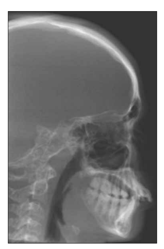
Figure 1 - Severe mandibular retrognathia and proalveolia of the upper arch.

and a high erythrocyte sedimentation rate (ESR).