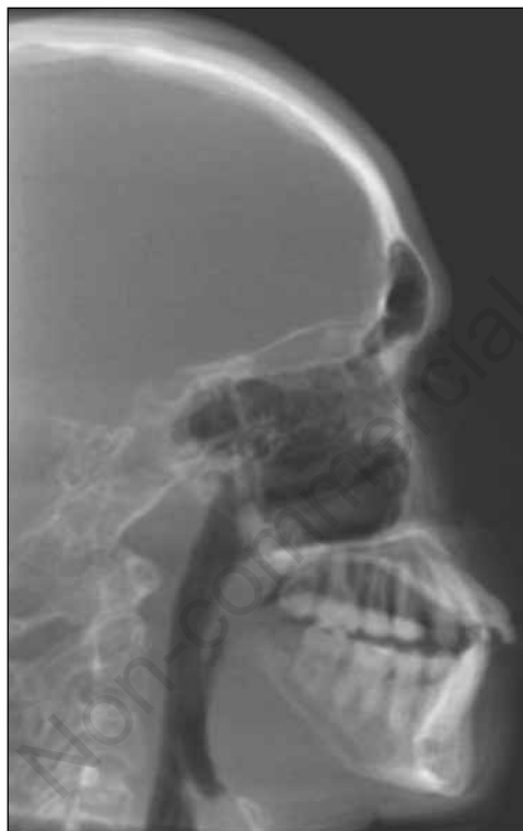
◀ Figure 4 - Cone beam computed tomography image showing correction of the retrognathia at the end of orthodontic treatment.

border. The results showed that the mandible had moved forward and downward in relation to the anterior cranial base. In addition, bone apposition was observed on almost all of the surfaces of both mandibular condyles and the roof of the glenoid fossa. TMJ involvement is often asymptomatic in patients with JIA, and can lead to severe craniofacial growth disturbances and facial deformities if left untreated (10). However, early TMJ arthritis is difficult to diagnose in JIA patients because of the relatively few symptoms and clinical findings (11, 12) and the fact that none of the clinical signs or symptoms of TMJ dysfunction are predictors of bony destruction. Consequently, the pathological process can affect growth long before any radiographic changes can be seen, and early collaboration between dentists and rheumatologists is very impor-