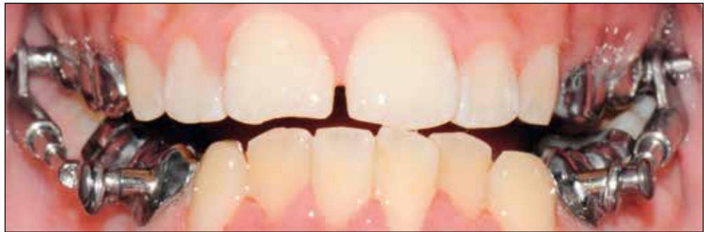
Figure 3 - Herbst appliance during function.