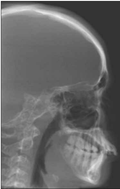
Figure 1 - Severe mandibular retrognathia and proalveolia of the upper arch.

and a high erythrocyte sedimentation rate (ESR).