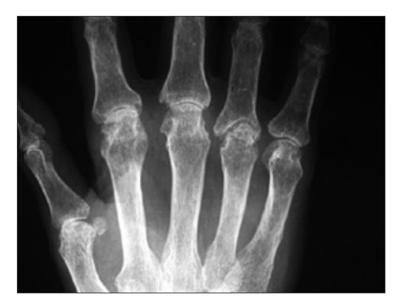
Figure 1 - X-ray: erosive changes of hand with pencil-in cup aspects of IV MCP joint.

progress to the arthritis mutilans with the aspect of opera-glass hand deformities (1). Proliferation of bone is a feature of PsA, involving particularly metaphysis and diaphysis of the hands and feet in the early phase of disease, before significant changes occur in the adjacent joint. Proliferation findings, accompanied by subchondral sclerosis, may take several aspects on x-Ray: spiculated, frayed or paintbrush appearance (1). Periosteal and endosteal bone formation may increase the radiodensity of an entire phalanx, and an "ivory" phalanx may result. Despite low sensitivity, this