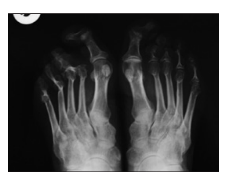
Figure 2 - X-Ray: severe destructive changes of feet.

finding is a specific and early radiographic manifestation of PsA (4).