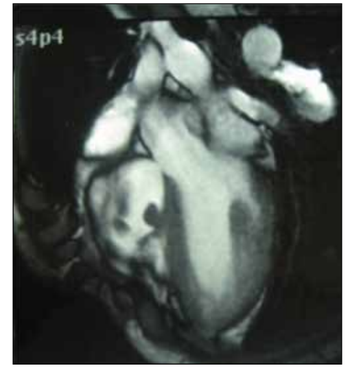
Figure 2 - Cardiac magnetic resonance image (four chamber view) showing two right intracardiac thrombi.